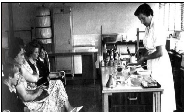
Rural Domestic Economy Class